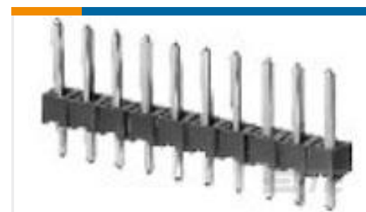
TE Part # 5-146281-2 02 MODII HDR SRST B/A LF