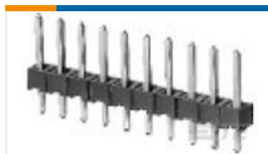
TE Part # 5-146285-2 02 MODII HDR SRST B/A .100CL