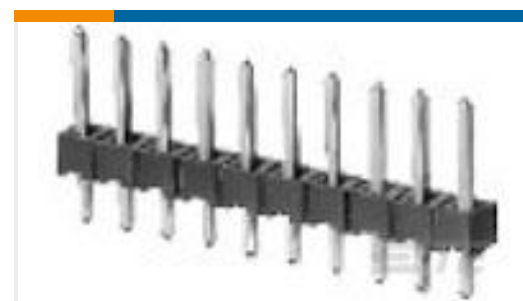
TE Part # 5-146277-2 02 MODII HDR SRST B/A .100CL